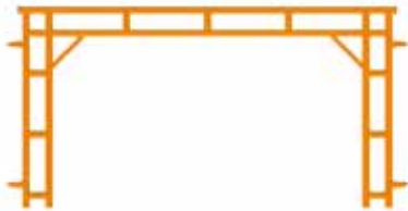
Stirrup Frames - another Equiptec innovation