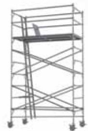
Without Stirrup Frames