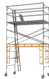
With Stirrup Frames

BETTER ACCESS, INCREASED VERSATILITY AND GREATER RIGIDITY.